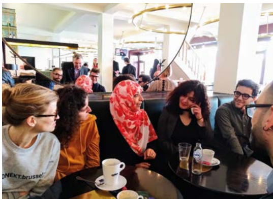
A delegation of our students meeting with Nobel Peace Prize-winner Tawakkol Karman