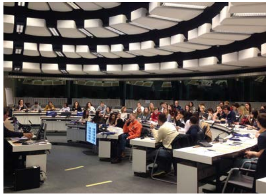
Our students hard at work in the European Parliament.